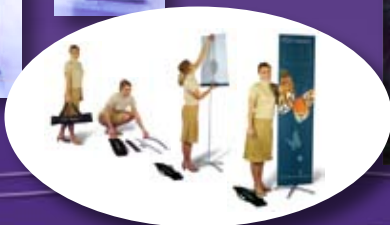
Assembly less than one minute