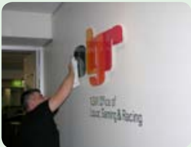
Office of Gaming and Liquor, Sydney