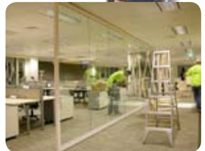
Macquarie Bank, Sydney