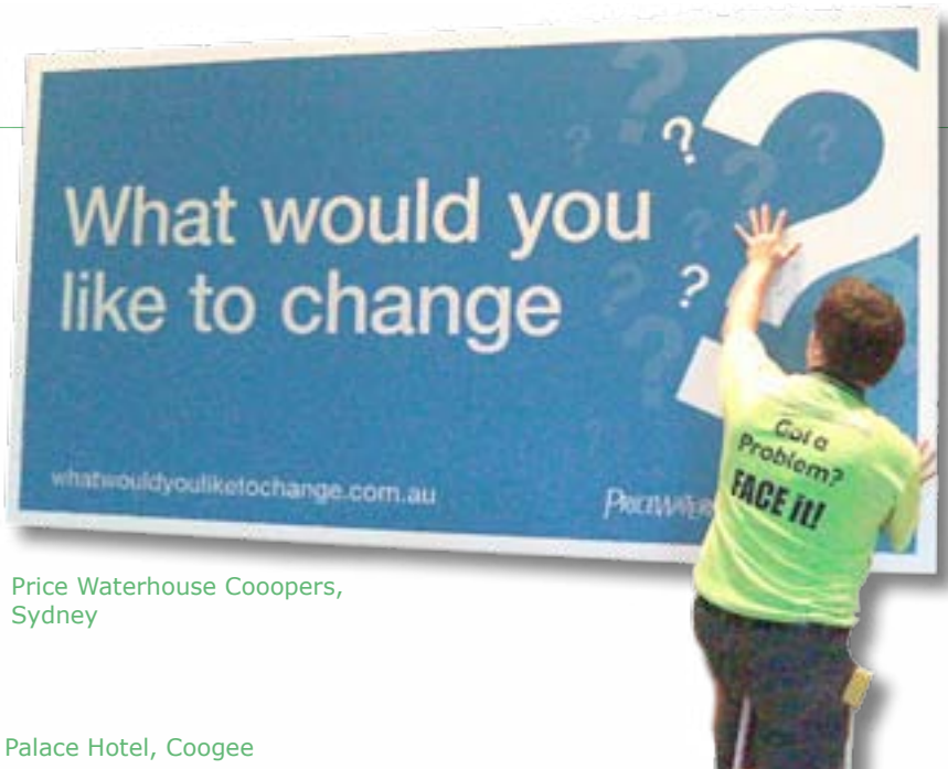
Price Waterhouse Coopers, Sydney